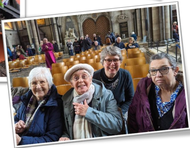
Above: A selection of the Easter Gardens made during Good Friday's Breakfast @theTin and opposite the Canalside contingent at the Cathedral for the Chrism Service on Maundy Thursday.